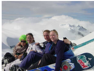
Photo taken Winter 2003

My friends and I went snowboarding in Colorado many times. It was awesome!