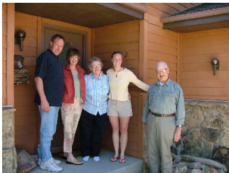
Photo taken Summer 2004: My father, mother, grandmother, me, and grandfather

Christmas in America is BIG. It is the biggest day of the year! Many Americans travel long distances to spend Christmas with their families. I spent Christmas with my family in Wyoming, U.S.A. It was wonderful. I saw my mother, father, sister, grandparents, aunts, uncles, and cousins. On Christmas morning we opened gifts. I gave many Japanese gifts to my family. I received clothes and money. My aunt cooked Christmas dinner. She cooked turkey, mashed potatoes, stuffing , bread sauce, gravy , and pumpkin pie....Hmmm Good! I enjoyed my Christmas very much.